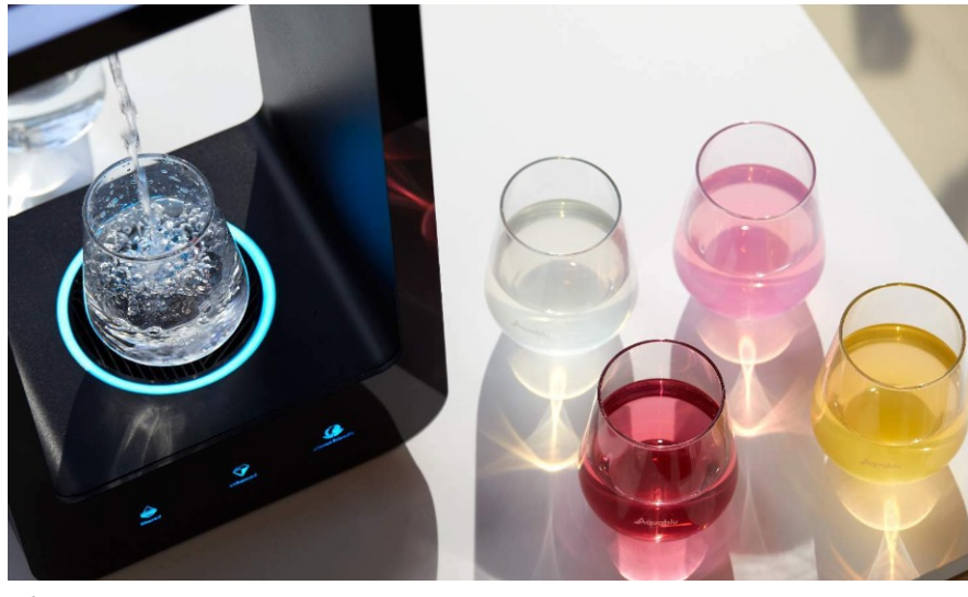
Image: Water dispenser Aquablu, unbottled functional & flavoured water. Sugar-free, filtered, free-vend and/or payment system ready, no additional cleaning or service

Finally, in most European jurisdictions hospitality staff is entitled to drinking water due to the physical aspects of the job and restroom taps do not count.