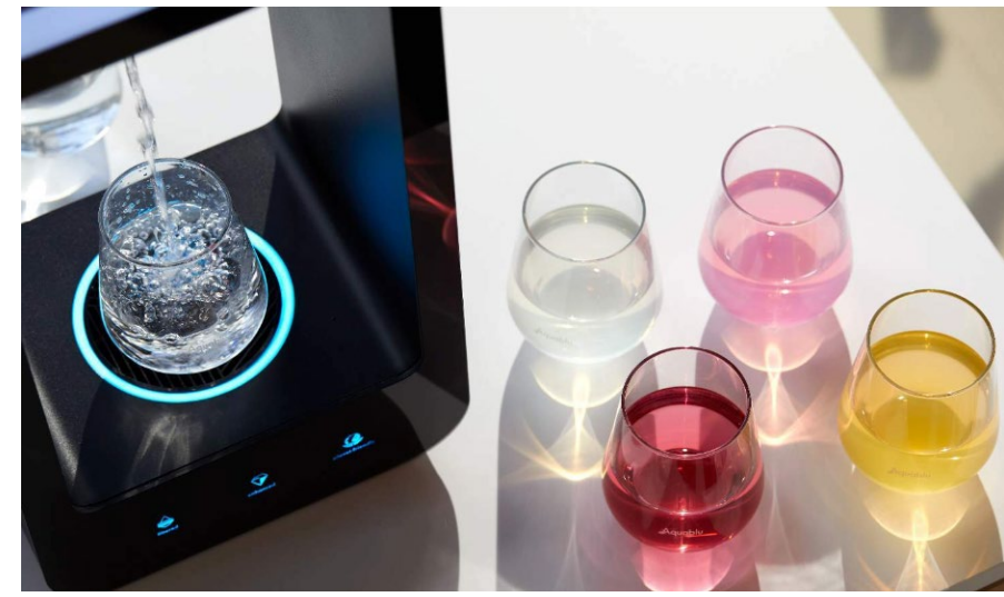
Image: Water dispenser Aquablu, unbottled functional & flavoured water. Sugar-free, filtered, free-vend and/or payment system ready, no additional cleaning or service

Finally, in most European jurisdictions hospitality staff is entitled to drinking water due to the physical aspects of the job and restroom taps do not count.